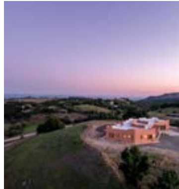
Adobe-Style Home, atop a Picturesque California Hillside

3403 PACIFIC VIEW WAY OCEANSIDE 4 Bed | 3.5 Bath | 2,256 SF Offered at $1,695,000