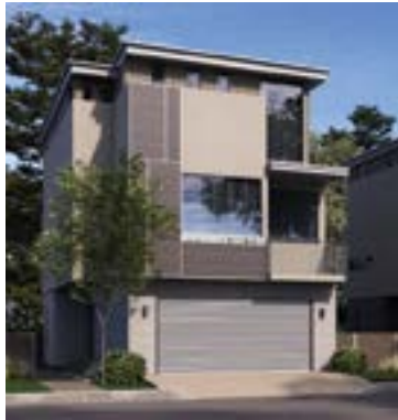
Elevating Luxury in Oceanside

631 3RD STREET Seller Financing Available | ENCINITAS 3 Office Spaces | 1 Apartment 2,855 SF | Offered at $4,650,000