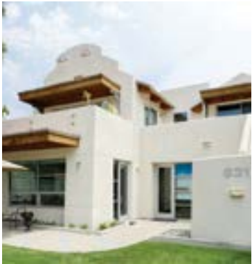
Mixed-Used Building Steps to the Beach

1752 DENTRO DE LOMAS | BONSALE 4 Bed | 3 Bath | 3358 SF | Offered at $1,779,000