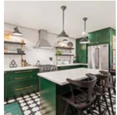
Enjoy This Updated Cabin With Rental Income

41565 AVENIDA LA CRESTA MURRIETA 4 Bed | 4 Bath | 3,306 SF Offered at $1,549,000