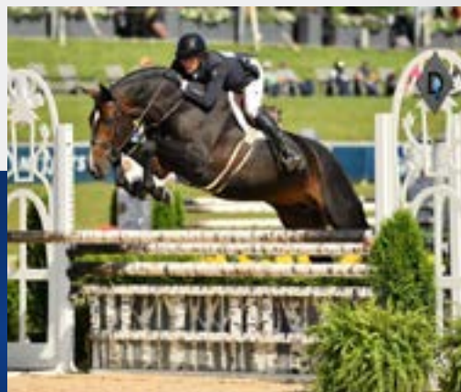
ANDREW RYBACK PHOTOGRAPHY