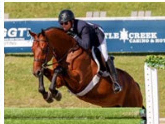
Central Spectacular TBD