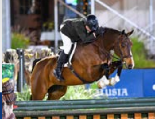
HIGH DESERT SPORT PHOTO