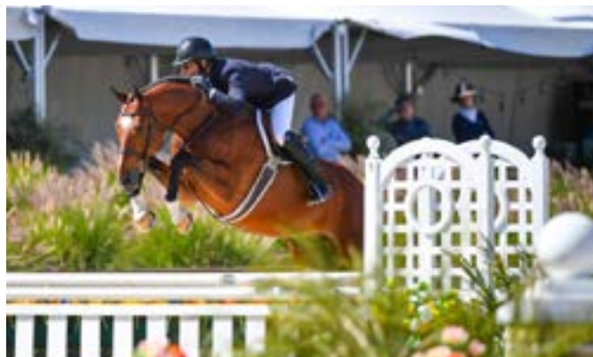
West Coast Spectacular March 12-16, 2025