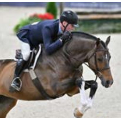
Capital Challenge September 29- October 5, 2025